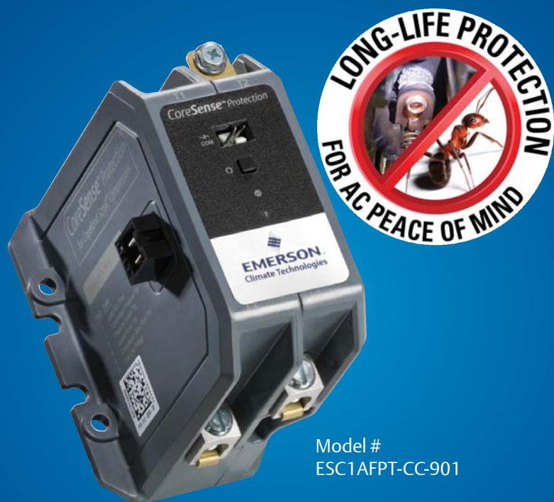
Model # ESC1AFPT-CC-901

This new innovation combines the functionality of a mechanical contactor with CoreSense technology to deliver unparalleled reliability, savings, and intelligence.